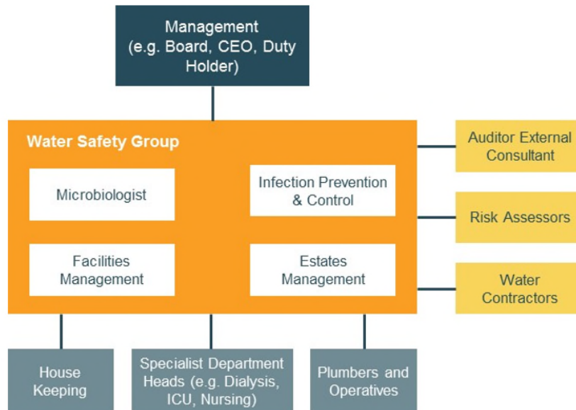
Figure 1: Organization Structure for the Duty Holder

Therefore, the municipal facility should provide a management function for monitoring and control of water systems and associated plant. An example structure is shown below: